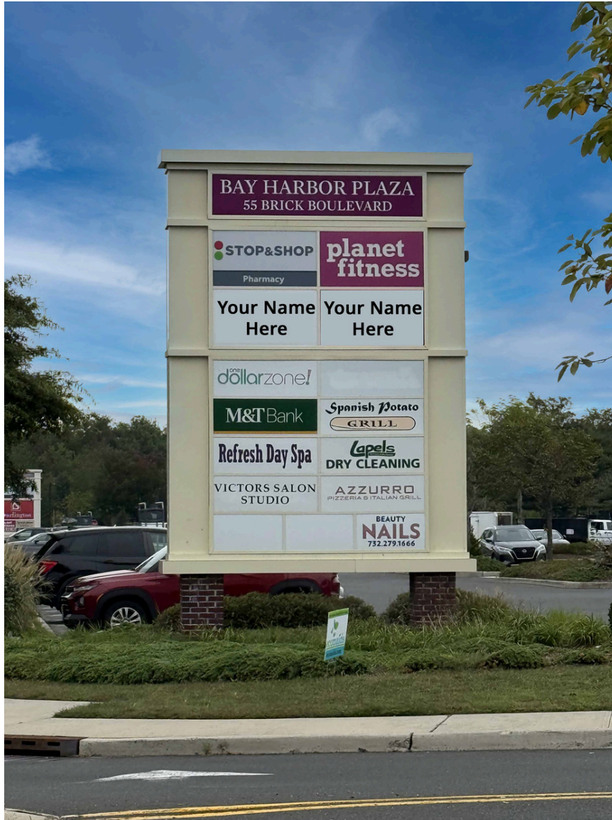
Pylon Sign #1